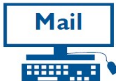
To your inbox

Sign Up at www.pilotbulletins.net/sign-up